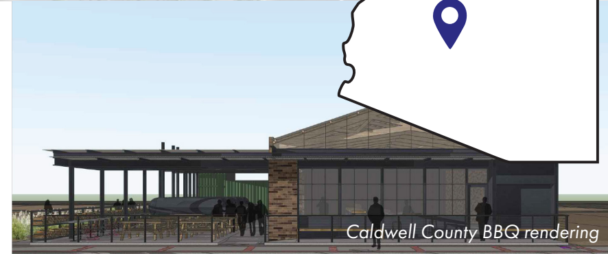
Caldwell County BBQ rendering