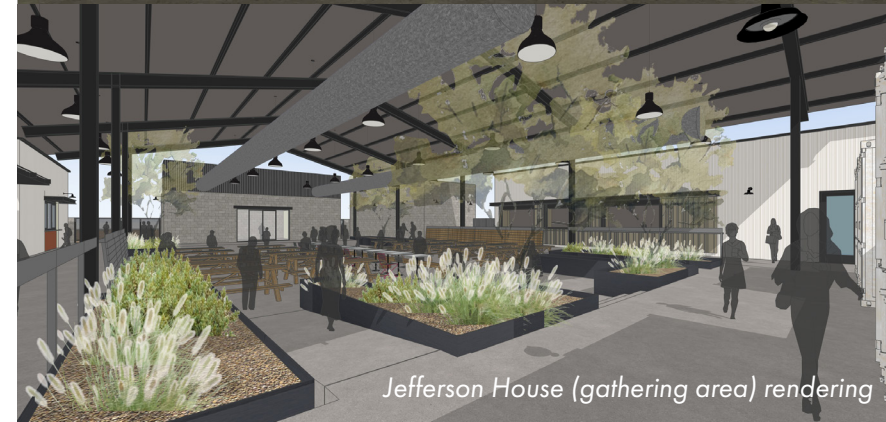
Jefferson House (gathering area) rendering