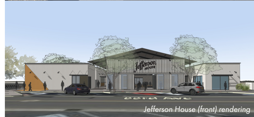
Jefferson House (front) rendering